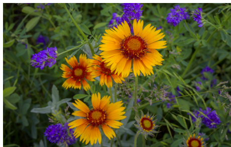
Blanket and alfalfa flowers