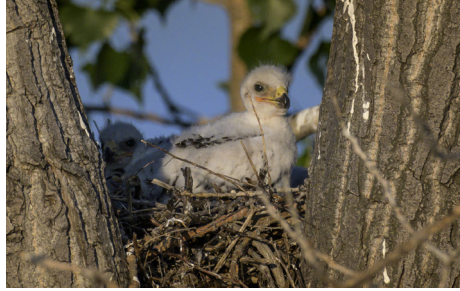
Ferruginous hawk chick